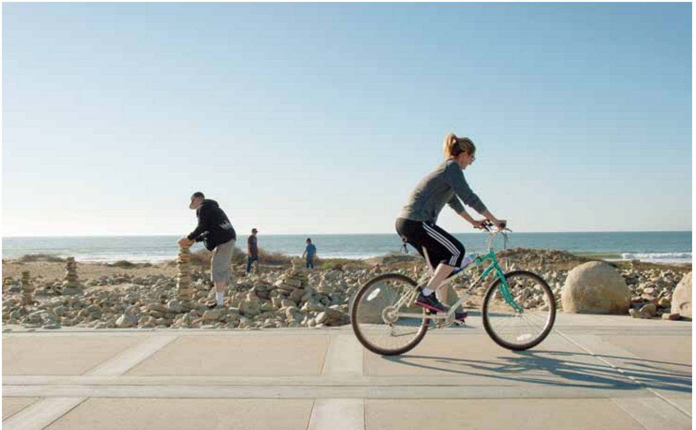
The Ventura Beach Bike Trail has undergone a multimillion-dollar face-lift and now features a smoother, wider path and a cobble garden where passersby are invited to create their own rock sculptures.